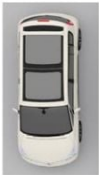
Carport 5.0 x 2.8