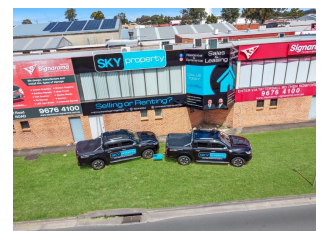
Sky Property Rental Team 0433 091 663